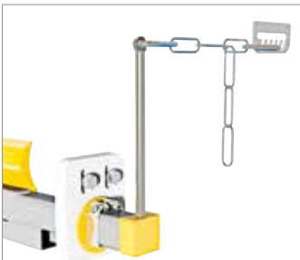
Mini-Rasmus blade full length spare part 8042 is 2.4m

Recommended for \varnothing 100-250 mm pulleys.