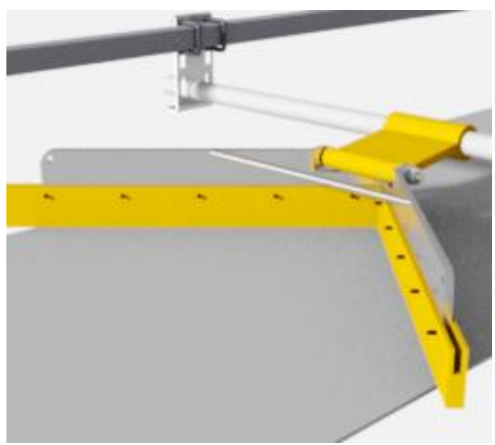
The MAXI-plough fitted on a belt with Vendig accessories MAXI-bracket 8891 and MAXI-piper 8890

Change the scraper strips (2) by removing the star screws that hold them to the galvanized steel frame (3). Assemble new lists on the frame.